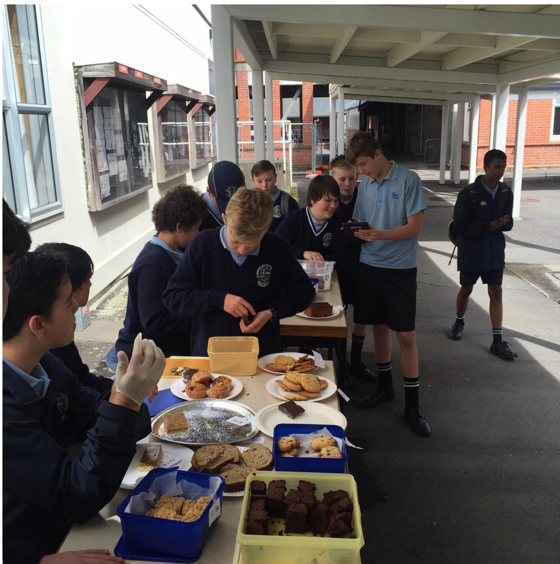
Students from 9HI - Bake Day - raising money for their Social Action project