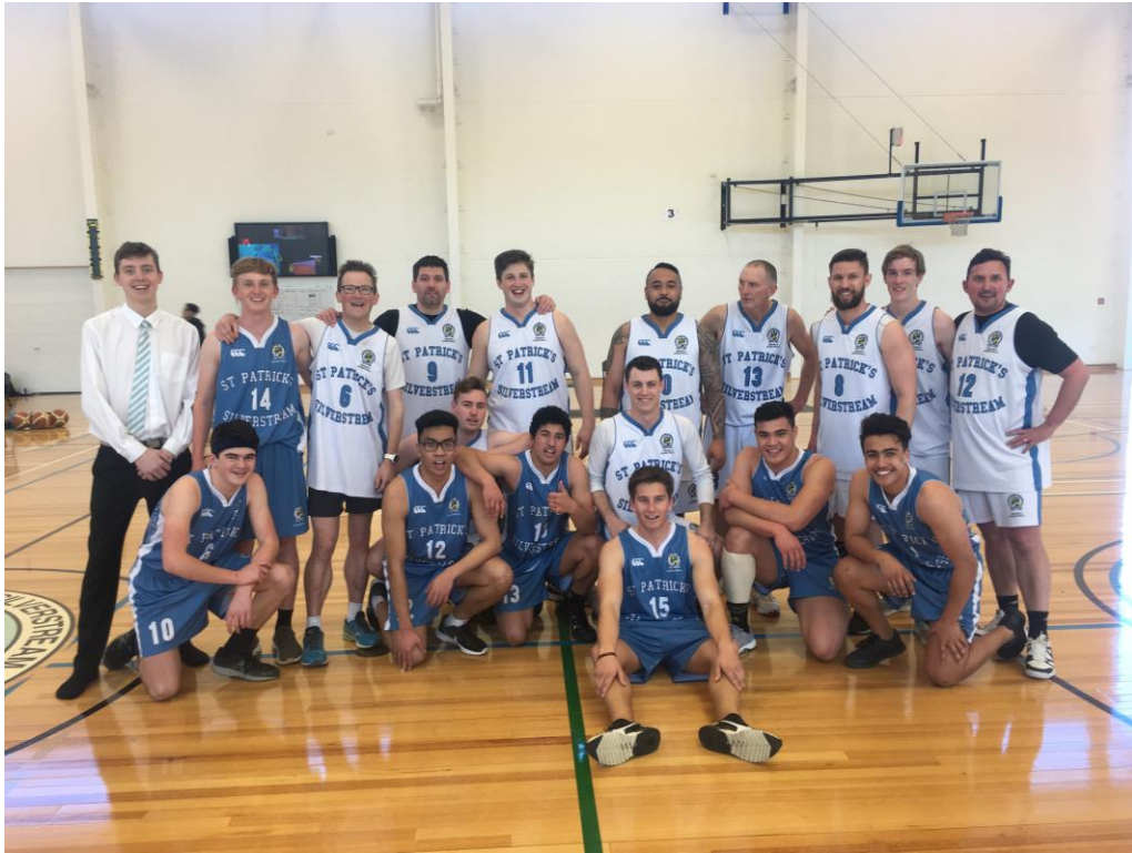
Staff Basketball team on leading the Year 13s Hoops for Hope