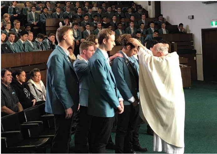
Laying on of Hands - part of the Sacrament of Confirmation.

After three months of learning and reflection, sixteen students received the Sacraments of Confirmation and First Holy Communion at Mass on the Feast of the Assumption. Four of the sixteen also received the Sacrament of Baptism. The ceremonies - Mass for the Junior School, and then mass for the Senior School - were very moving and had an obvious impact on the students at each ceremony.