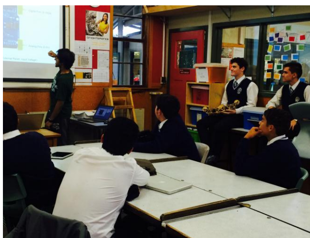
Senior Robotics Tutorial