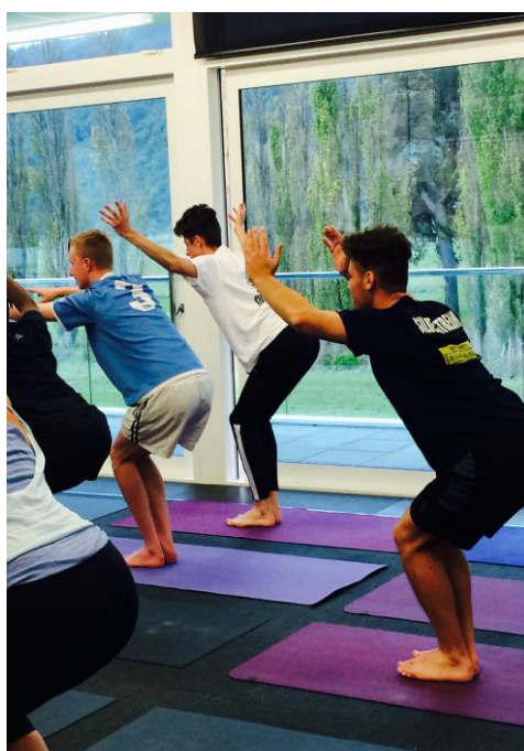
Year 13 Yoga Session