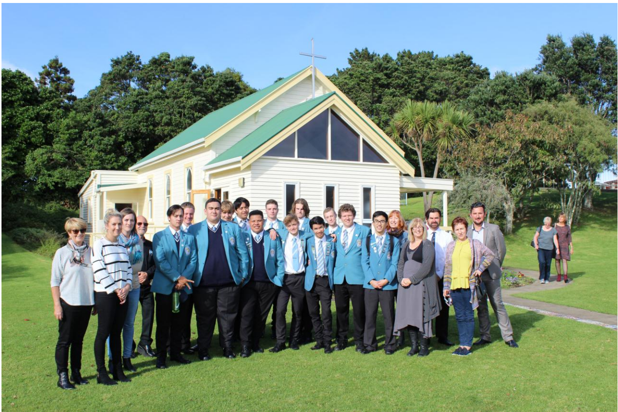
O'Shea Shield Team outside the Chapel at Sacred Heart College, New Plymouth

O'Shea Shield is bigger than the competition and one of the team members captured the essence of being involved in O'Shea beautifully when he wrote: "It has opened new friendships, new skills in and out of school, but also exploring my faith and what I believe in. Events and experiences like O'Shea I am truly grateful for as there are students and teachers who see talent and potential in me, a group of supportive people who see something special that I might not necessarily see."